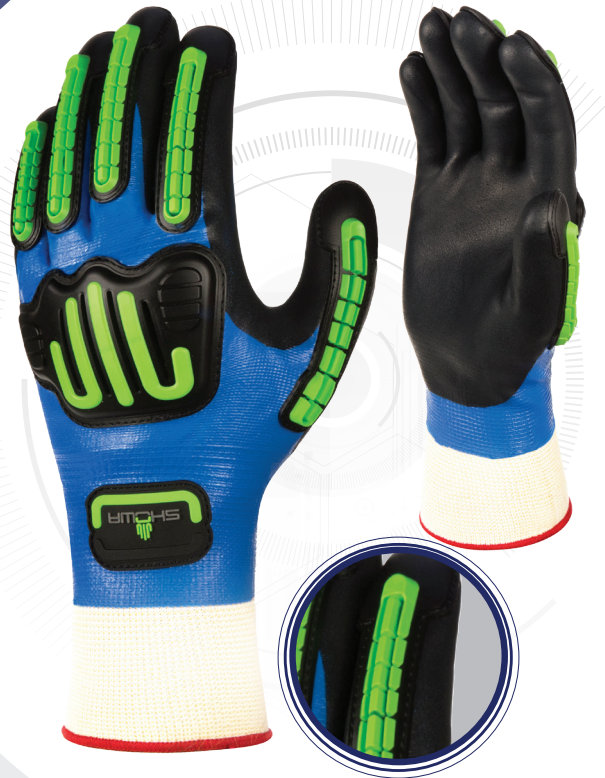
Flexible and Durable TPR Shields