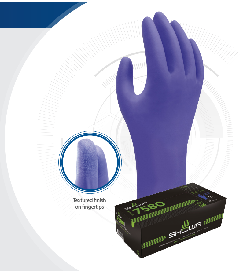
Textured finish on fingertips