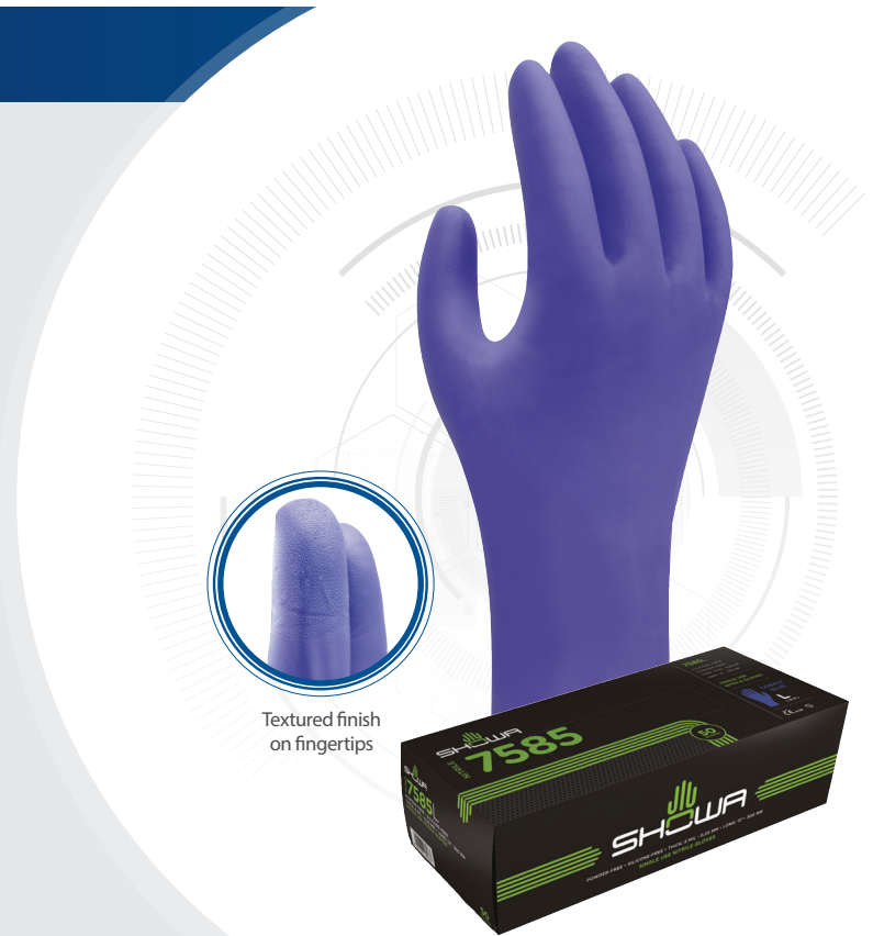
Textured finish on fingertips